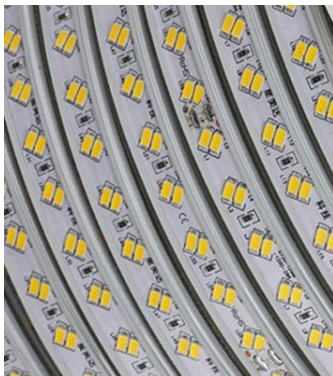
::: Double Line