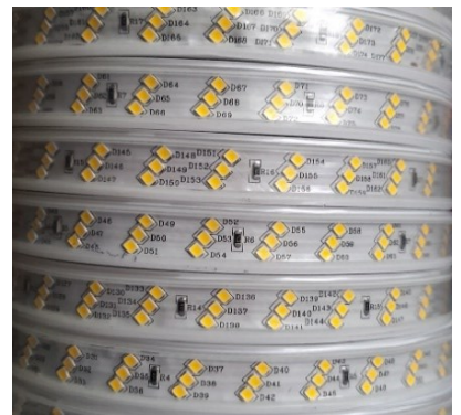
::: Triple Line